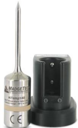
IFC400 (sold separately)

Using the MadgeTech Software, starting, stopping and downloading the HiTemp140 is simple and easy. To use, simply place the HiTemp140 in the IFC400 or IFC406 docking station (sold separately). Using the software, an immediate or delay start can be chosen, as well as the reading rate. Start the data logger, remove it from the docking station and the device is ready to be deployed. Graphical, tabular and summary data is provided for analysis and data can be viewed in °C, °F, K or °R. The data can also be automatically exported to Excel® for further calculations.